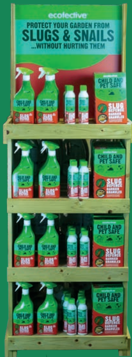
Wooden Stand 60cm Natural Slug & Snail Defence POSWS002