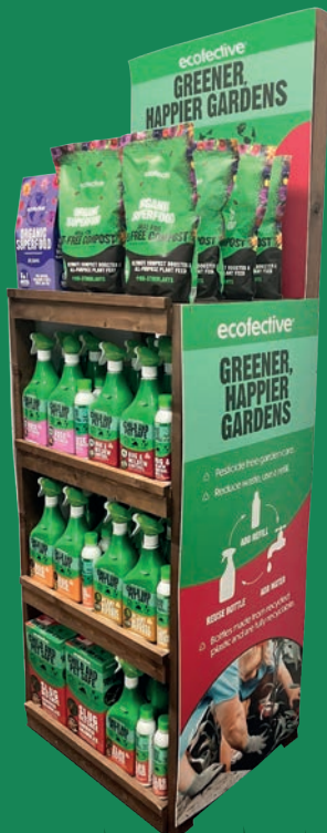
Wooden Stand 2 x 60cm Greener Happier Gardens POSWS004