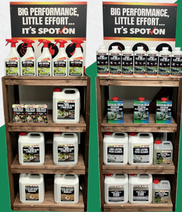
Wooden Stand 2 x 60cm SPOT-ON Range POSWS005