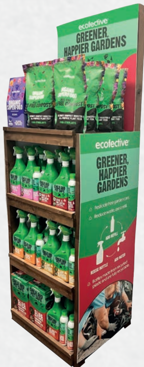
Wooden Stand 60cm Greener Happier Garden POSWS001