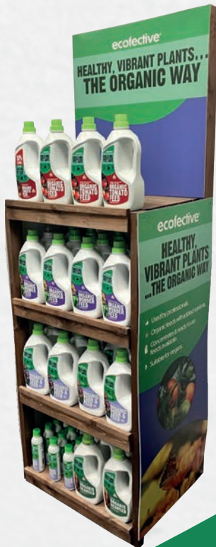
Wooden Stand 60cm Organic Feeds POSWS003